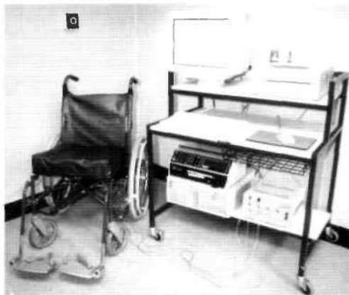
Fig 1. Equipment used to record air pressure, interface pressure and pressure-time cycle characteristics of the cushions.

(d) Pro-Active Seating System (Pegasus Airwave Ltd, Hants). The cushion consists of six air cells arranged longitudinally, plus a foam section in front to support the thighs. Two outer cells, one on each side, are permanently inflated