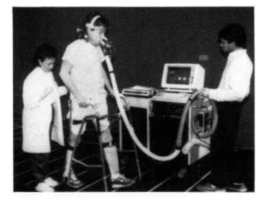
Figure 2. A subject being measured during a testing session showing the mouthpiece, noseclip, and headgear with the metabolic cart.

VO_2 , VCO_2 , respiratory rate, and heart rate were collected for 5 minutes while the subject sat quietly. These metabolic measures were collected for 3 minutes once the subject stood to establish basal HR and energy expenditure during quiet standing. The subject was then instructed to walk along a 12 metre gait lane at a self-selected velocity. Care was taken to keep the metabolic cart and flexible tube slack so that it did not interfere with the subject's