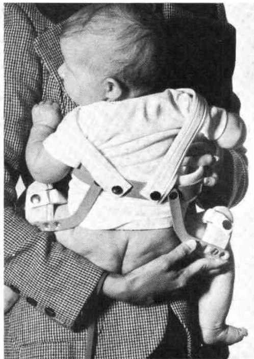
Fig. 2. The "occasional cuddle".

The device has now been used for a year with 20 patients completing treatment. All hips remain reduced and no instances of avascular necrosis have been recorded. However, this experience is currently uncontrolled and a longer-term controlled study is underway. At present however, the mothers involved are