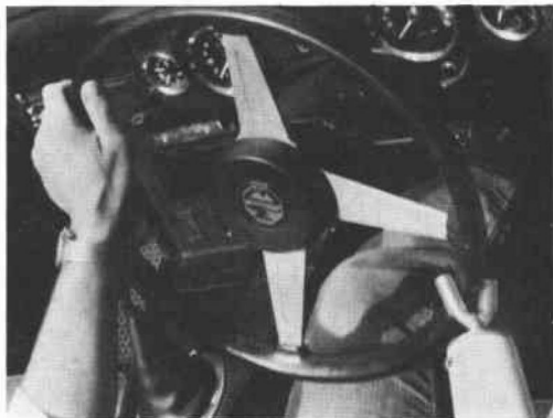
Fig. 3 The driving hook in use.

The simple fixed hook appliance described has been used for the past 14 years by the author, a congenital below-elbow right-hand amputee, to drive a wide variety of vehicles, including high-performance cars (Fig. 3) and heavy four-wheel-