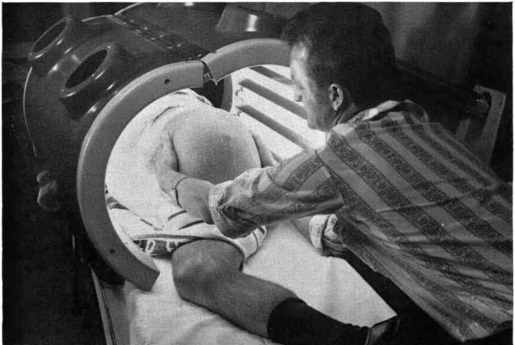
Fig. 2. Temporary hip disarticulation prosthesis. Application of pressure during curing to ensure a good fit.

With the patient now in a supine position the base plate of an Otto Bock modular system is fitted as close as possible to the Lightcast II basket in the proper place of alignment. It is adhered with a mixture of resin and sawdust. More strips of Lightcast II tape are now