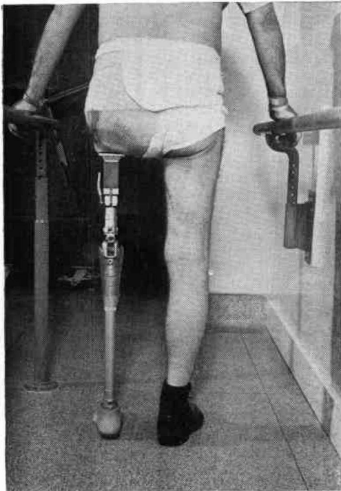
Fig. 3. Temporary hip disarticulation prosthesis completed.

After curing, the dacron felt liner can be pulled down over the edges of the basket and glued in place. Two velcro straps fasten anteriorly for suspension and the modular prosthetic system can now be reassembled and dynamic alignment performed (Figure 3).