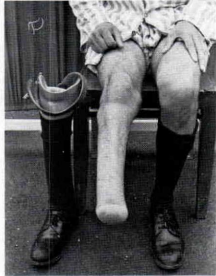
Figure 2. A modified Symes residual limb.

Postoperatively, we give an "elephant boot" after four weeks when the heel pad is firmly fixed to the cut bone end. Weight bearing "sets" the residual limb, and boosts the patients' morale. After another three to four weeks, the fabrication of the prosthesis starts.