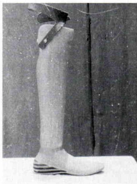
Figure 3. Our Symes Prosthesis.