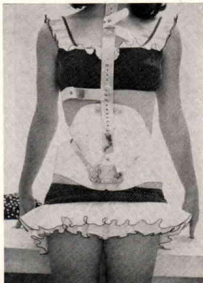
Note pivot and hinge arrangement.

All corrective pads were also made of Orthoplast. These were cut to proper size and directly molded on the patient. No padding was used on the dorsal pad and axillary sling. To lend additional strength to the sling and to prevent its distortion it was lightly reinforced with SS. All straps were fashioned of 1" nylon webbing. The cushion for the lumbar pad, chin