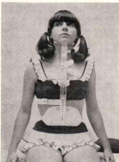
Ready for a cool and refreshing dip.

To construct the pelvic girdle Orthoplast was chosen for reasons of lightness, strength, good appearance, ease of molding, and relative low cost.