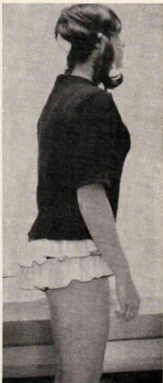
Dressed, many of the projections of the regular Milwaukee brace are absent.

The patient's reaction to this brace was favorable. The points favored were: 1. Lightness. The brace with pads weighed 4\frac{1}{4} lbs— vs. the 6\frac{1}{4} of the conventional brace. 2. Coolness. Although Orthoplast is not porous, the perforation of the girdle probably accounted for this reaction. 3. Greater comfort—particularly during rest. The posterior single bar is less of a hindrance in the recumbent position as well as its closeness to the body. Also, the rather large occipital piece exerts pressure more evenly over a greater area. 4. Better cosmesis. Due to the close contouring of the superstructure and the singly located posterior bar it permits a more normal fit of clothes. (It should be noted, though, that sufficient clearance is given so as not to interfere with exercising within the brace).