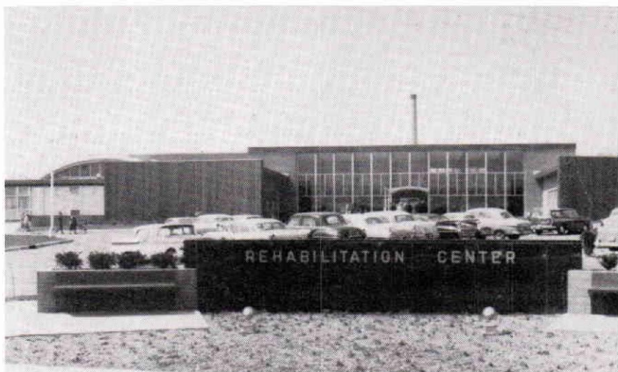
The Pennsylvania Rehabilitation Center at Johnstown, Pennsylvania, new center opened April 16, with a number of OALMA members from New York and Pennsylvania in attendance. It is believed to be one of the finest rehabilitation centers in the world.