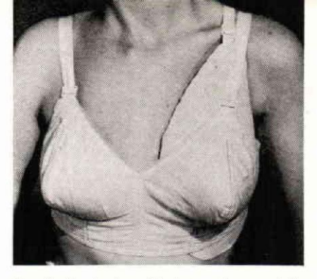
Fig. 3. Front view illustrates the carefully sculptured restoration of the atrophied left breast.