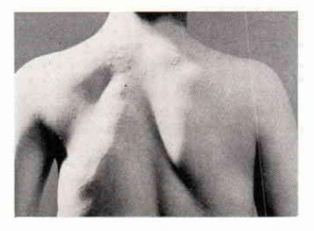
Fig. 1. Shows depression left by surgery. Side was also deficient and there existed a most serious atrophy of the left breast.