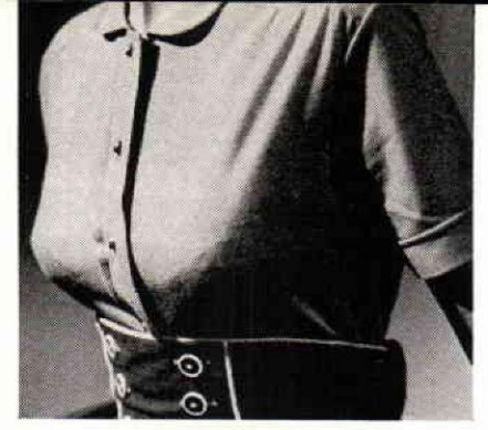
Fig. 4. The full effect of the prosthesis as seen under clothing.

The process of having the cast made is very tiring to the patient and the whole procedure requires the full cooperation of patient and prosthetist.