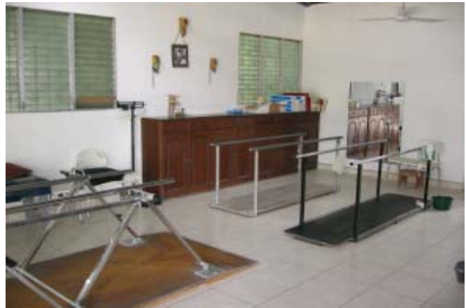
Gait training facilities at ROMP's Loren J. Mallon Centro de Rehabilitacion in Zacapa, Guatemala.

NUPOC annually offers the International Service trip to trained prosthetists and