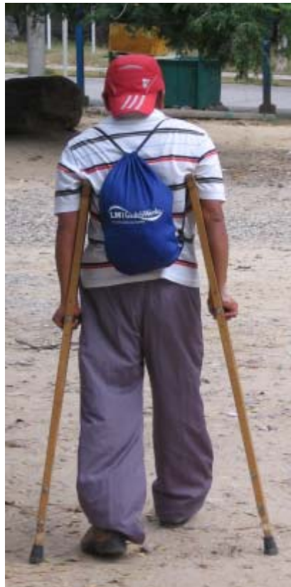
Mobility restored: A ROMP client fitted with a hip disarticulation prosthesis eagerly resumes independent activities.