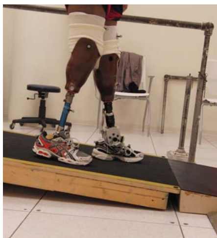
Subject walked down a 5° ramp using both a non-adapting prosthetic ankle (left) and the NUPOC prosthetic ankle (right).

Gait data were processed using CORTEX and MATLAB software. The results from the ABC scale were collected (100% would indicate full confidence in the tasks described in the questionnaire). For the PEQ-MS, the point value for all questions were added (a maximum possible value of 48 indicates full mobility).