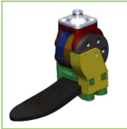
Mr. Nickel's rendering depicts the adaptable ankle as a computerized 3-dimensional graphic.

The purpose of the current phase of the Variable Equilibrium Point Prosthetic Ankle project was to develop a prototype prosthetic ankle that automatically adapts to sloped surfaces with each step and is sufficiently durable for short-term field trials. The prototype that we developed switches between