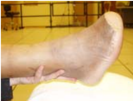
Figure 1: Partial foot (transmetatarsal).

This work was supported through funds from the National Institute on Disability and Rehabilitation Research of the United States Department of Education under grant H133E030030. The opinions in this publication are those of the grantee and do not necessarily reflect those of the Department of Education. The author acknowledges the use of the VA Chicago Motion Analysis Research Laboratory of the Jesse Brown VA Medical Center, Chicago, IL.