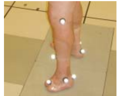
Figure 2: Partial foot with markers attached for gait analysis.

Recent investigations of partial foot amputees have reported relatively normal or reduced ankle motion in barefoot studies (Boyd et al. , 1999; Garbalosa et al. , 1996; Tang et al. , 2004) but increased dorsiflexion range in studies involving footwear and below-ankle prosthetic/orthotic interventions (Tang et al. , 2004; Dillon et al. , 2001). We are exploring these issues using a mechanical model of the leg, ankle and foot, and are comparing marker-based measurements to those obtained using a potentiometer mounted within the mechanical model (Figure 3).