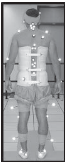
Figure 1: An able-bodied subject wears the fiberglass body jacket and the markers that were designed for this project.

A second hypothesis was that restricting spinal motion produces gait compensations. To address this hypothesis, data were collected as able-bodied subjects walked with