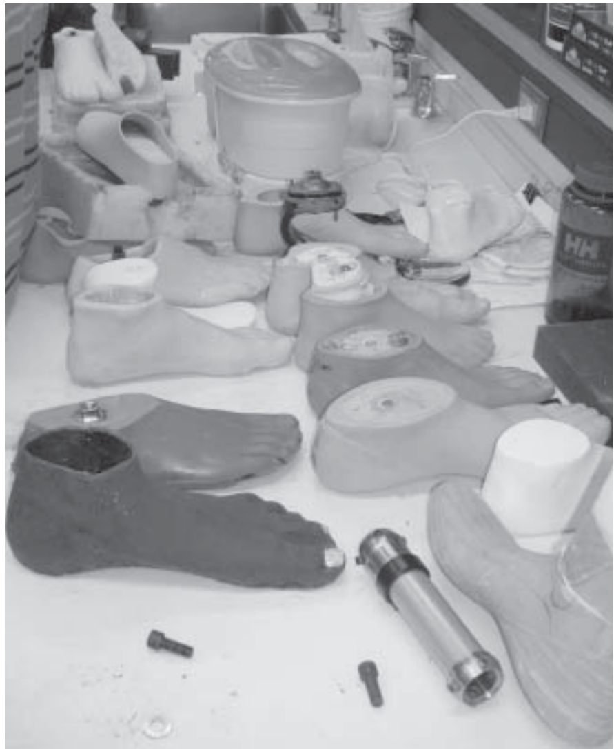
Shown above are some of the prosthetic feet displayed at NURERC's recent Open House for ICORR participants

application of robotics in our laboratory. We hope that NURERC's Open House helped forge new interest and understanding about ways to combine robotics with research engineering in the field of prosthetics and orthotics.