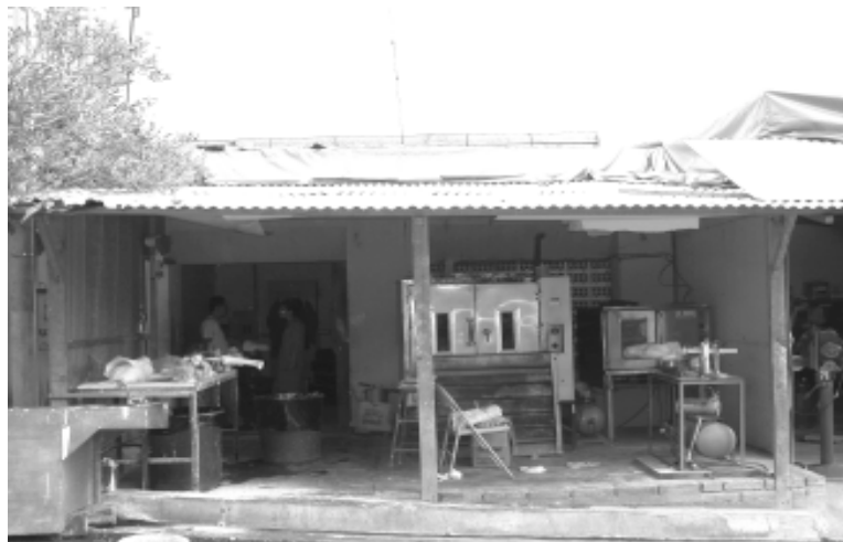
A January 2001 earthquake damaged the main FUNTER building. This was the temporary work shop.

ing speeds: (1) at their normal, comfortable walking speed, (2) walking as slow as possible without losing balance, and (3) walking as fast as possible without running. A minimum of three trials was conducted. The participants were tested first with their current prosthesis in order to receive a baseline measurement to which we compared the walking performance with the “Shape&Roll” foot. Thereafter, they switched to their test prosthesis with its “Shape&Roll” prosthetic foot. The same gait evaluation as described previously was conducted. After the completion of this entire second evaluation session, the participants were asked to wear their test prosthesis exclusively for a three-week evaluation. Their every-day prosthesis was given to them as a safety precaution so that in case of unforeseen difficulties they would be able to switch back.