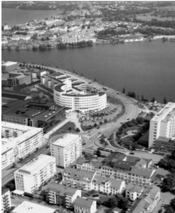
Jönköping, Sweden was the site of the first International Prosthetics and Orthotics Educators meeting.

Other well-known participants in the conference included representatives from the University of Strathclyde, in Glasgow, Scotland, LaTrobe University in Melbourne, Australia, and Honk Kong Polytechnical University.