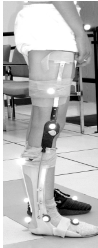
The first KAFO Allison made was used with a subject with no paralysis or gait limitations and was used as an initial gait analysis.

Preliminary data from the Veterans Affairs Chicago Motion Analysis Research Laboratory (VACMRL) indicates that these knee joints allow their wearers to walk faster and with less compensatory motions than are seen with the traditional locked orthotic knee joints that are normally given to people who wear KAFOs to compensate for weak knee extensor muscles. These knee joints appear to decrease the energy wearers must ex-